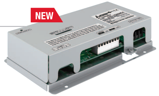
Dimension: 7-7/8(W) x 4-3/4(H) x 1-13/16(D) in. 200(W) x 120(H) x 45(D) mm

NO MORE PLCs ARE NEEDED! OUR NEW PI CONTROLLER MAKES IT POSSIBLE TO PERFORM ENERGY SAVING WITHOUT PLC, WHICH IS COST SAVING.